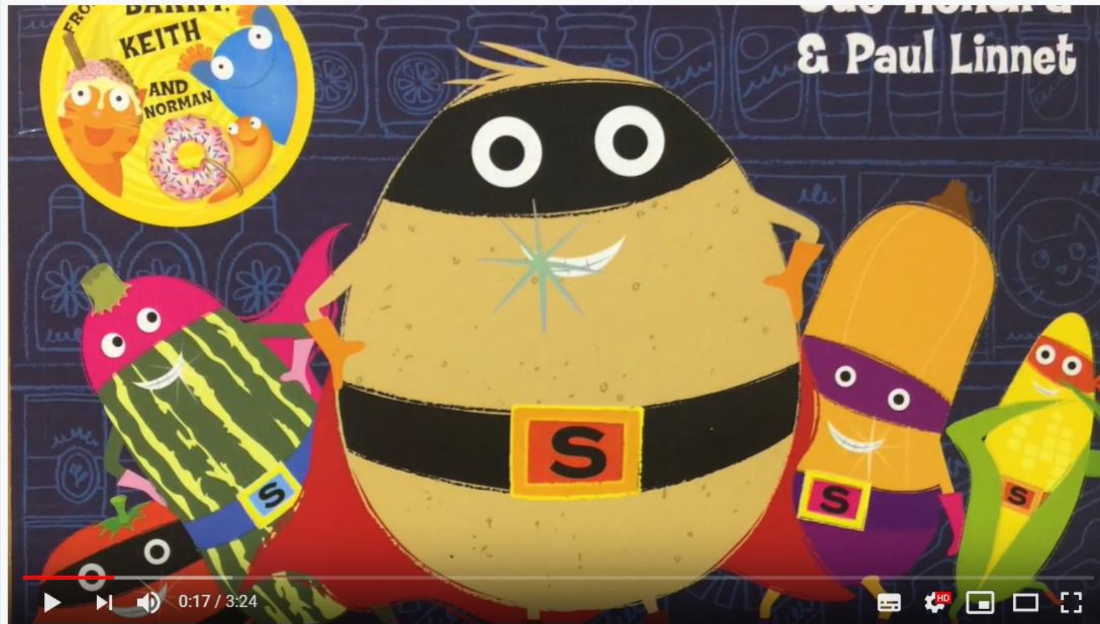
DJPA Assembly Stories Episode 4 - "SuperTato - Veggies Assemble"

https://www.youtube.com/watch?v=lr107eJwFyU